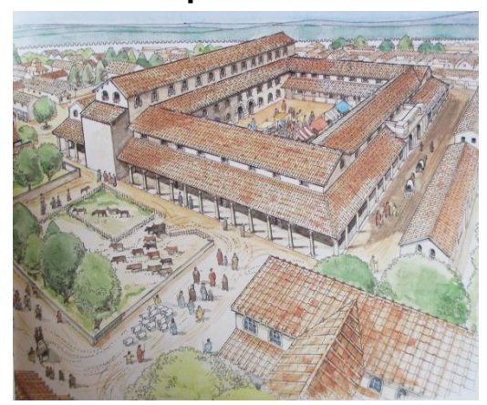
Plan of Caerwent Roman town, Wales